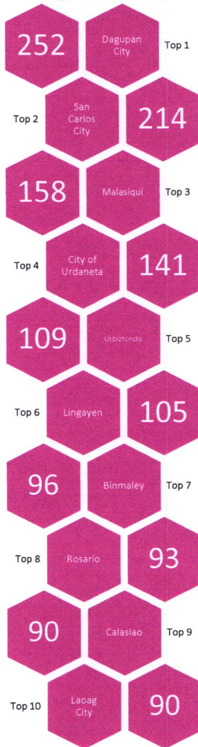
Figure 3. Top Ten Cities/Municipalities with the Highest Number of Registered Marriages, Ilocos Region: January 2020

Source: Preliminary results from the Decentralized Vital Statistics System