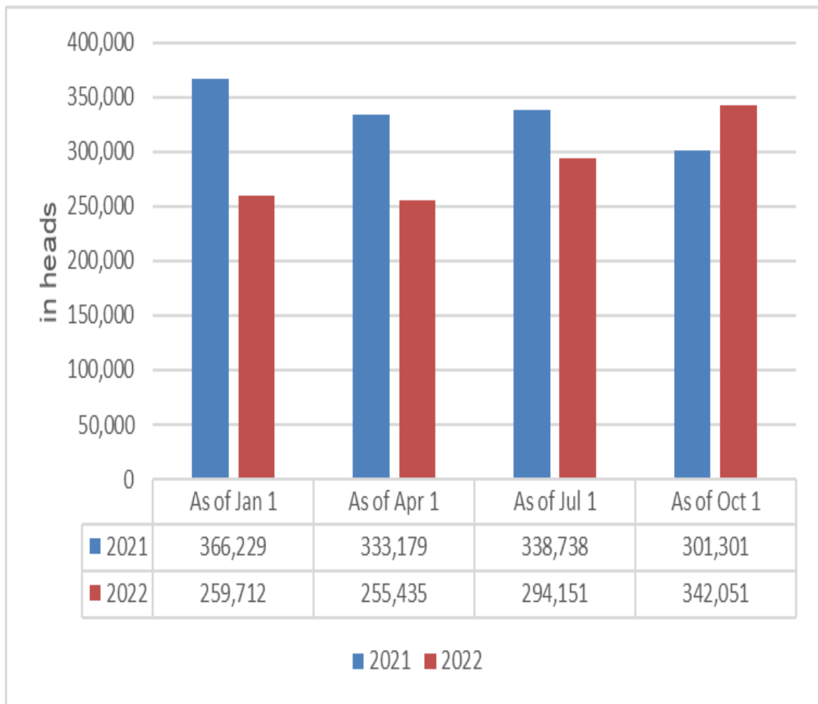
Figure 2. Inventory of Swine by Reference Date, Ilocos Region 2021 and 2022