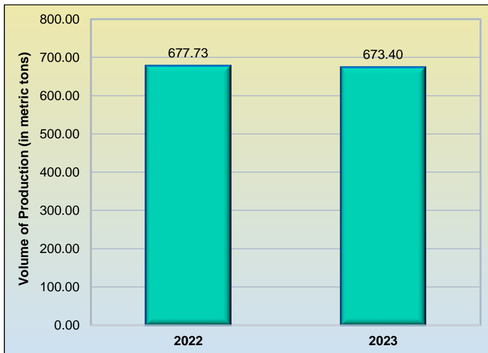
Figure 1. Volume of Commercial Fisheries Production La Union: 2022 and 2023