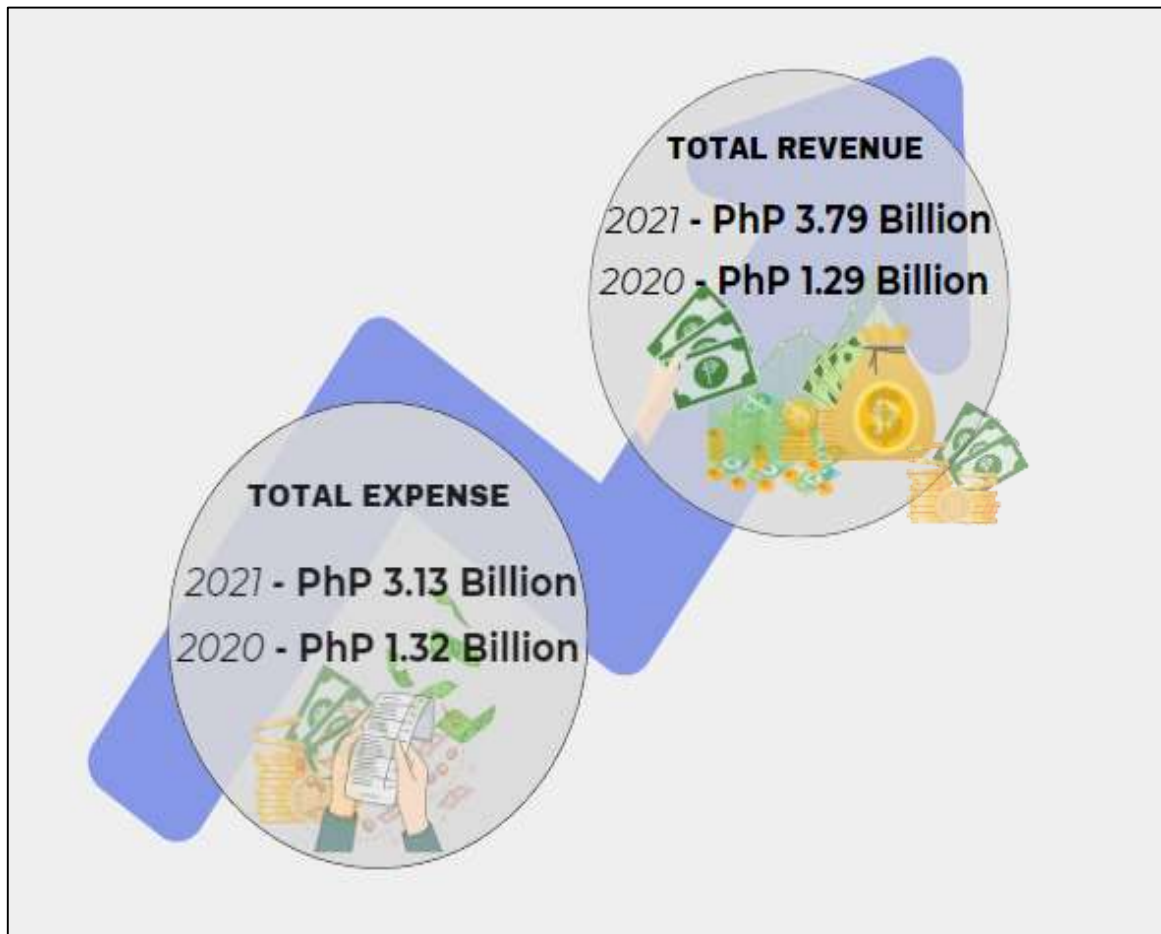
Figure 4. Total Revenue and Total Expense in the Information and Communication Section, Ilocos Region: 2021 vs 2020