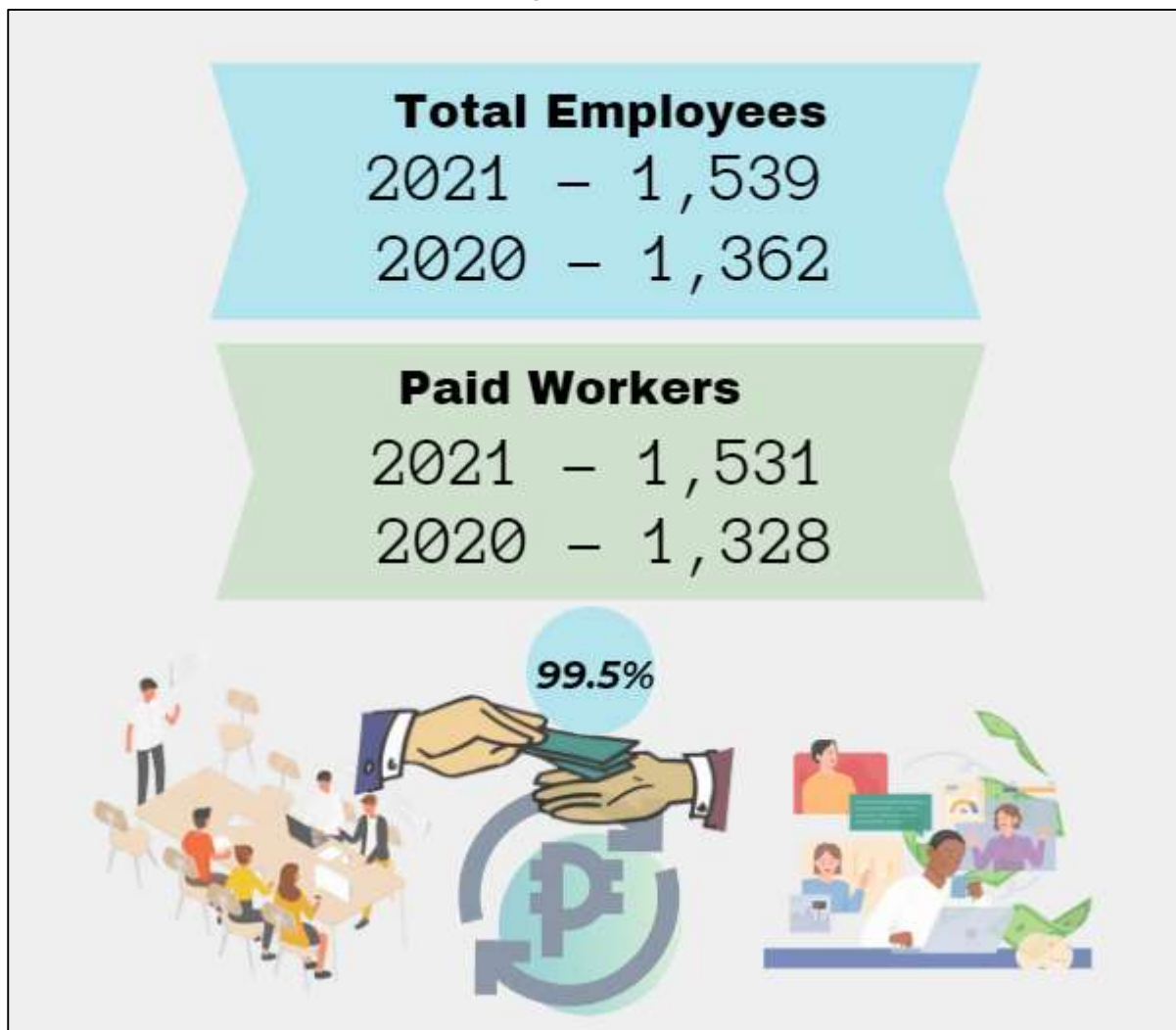
Figure 2. Employment in the Information and Communication Section, Ilocos Region: 2021 vs 2020