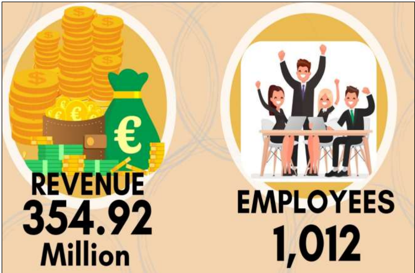
Figure 2. Total Paid Employees and Total Revenue in the Professional, Scientific and Technical Activities Sector, Ilocos Region: 2021

Source: Philippine Statistics Authority, 2021 ASPBI (Final Results)