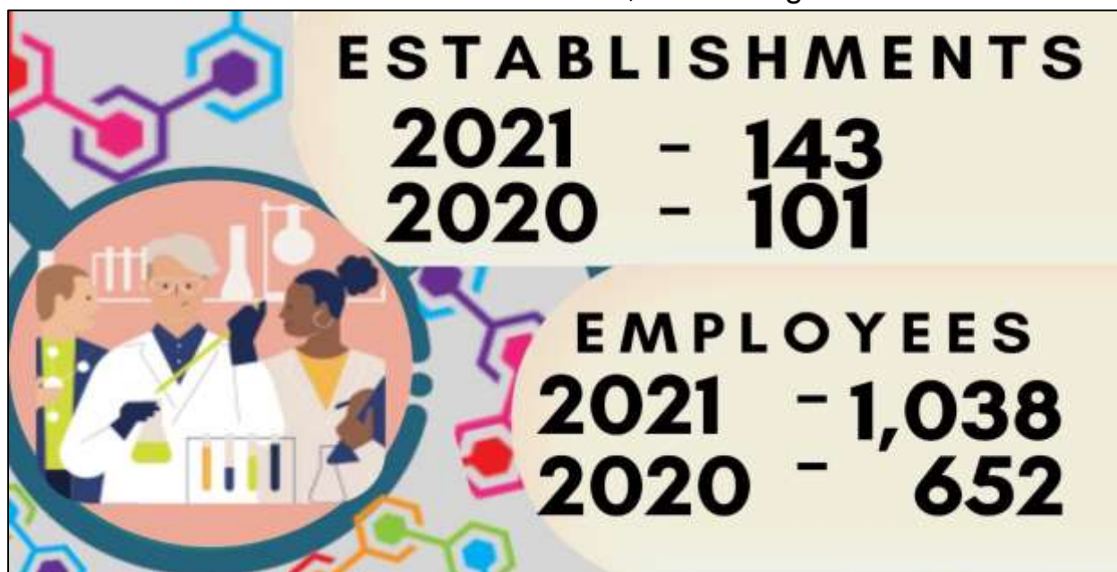
Figure 1. Number of Establishments and Employees in the Professional, Scientific and Technical Activities Sector, Ilocos Region: 2021 vs 2020