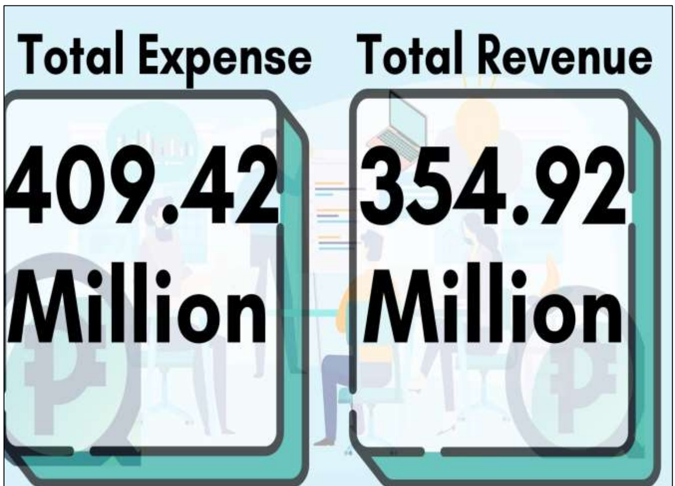
Figure 3. Total Expense and Revenue in the Professional, Scientific and Technical Activities Sector, Ilocos Region: 2021