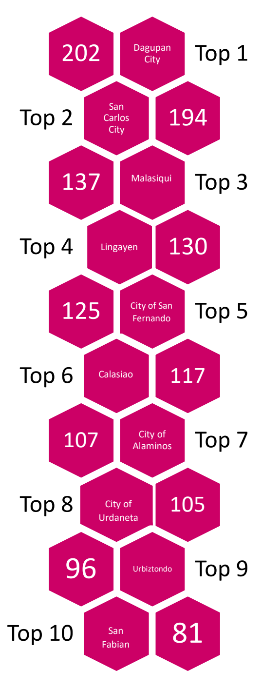
Figure 3. Top Ten Cities/Municipalities with the Highest Number of Registered Marriages, Ilocos Region: 1st Quarter 2021