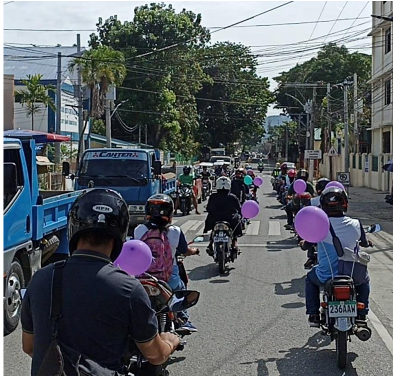
The 33 rd NSM celebration in La Union kicks off with a motorcade around the City of San Fernando, La Union on October 11, 2022 which was participated by the members of PSC – La Union and representatives from line agencies, LGUs, academe, and the media.