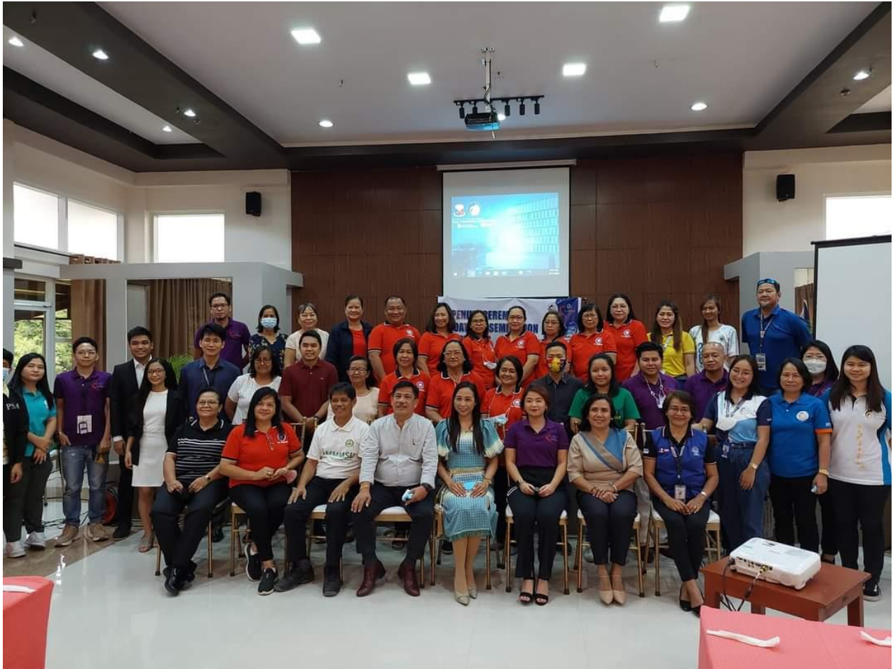
Provincial Statistics Committee members, PSA personnel, representatives from the LGUs, and partners from the academe and the media attend the 33 rd NSM Opening Ceremony on October 11, 2022 at Ynad's Place Hotel and Resort, City of San Fernando, La Union.