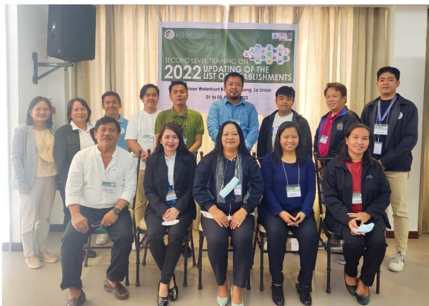
Officials and Focal Persons of PSA – RSSO I and PSA – Central Office pose for a group picture during the 2 nd Level Training on the 2022 ULE.

Date of Release: 01 August 2022 Reference No. 2022-019