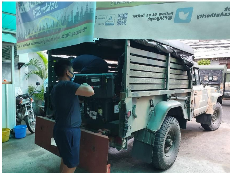
A member of the Armed Forces of the Philippines unloads the registration kit at the Provincial Statistical Office of La Union.

The registration kits for the Philippine Identification System (PhilSys) Step 2 Registration are delivered to the Provincial Statistical Offices of Ilocos Sur, La Union and Pangasinan with assistance from the Department of National Defense (DND).