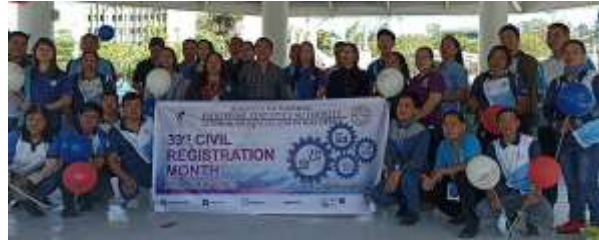
Motorcade and Opening of the Provincial CRM Exhibit