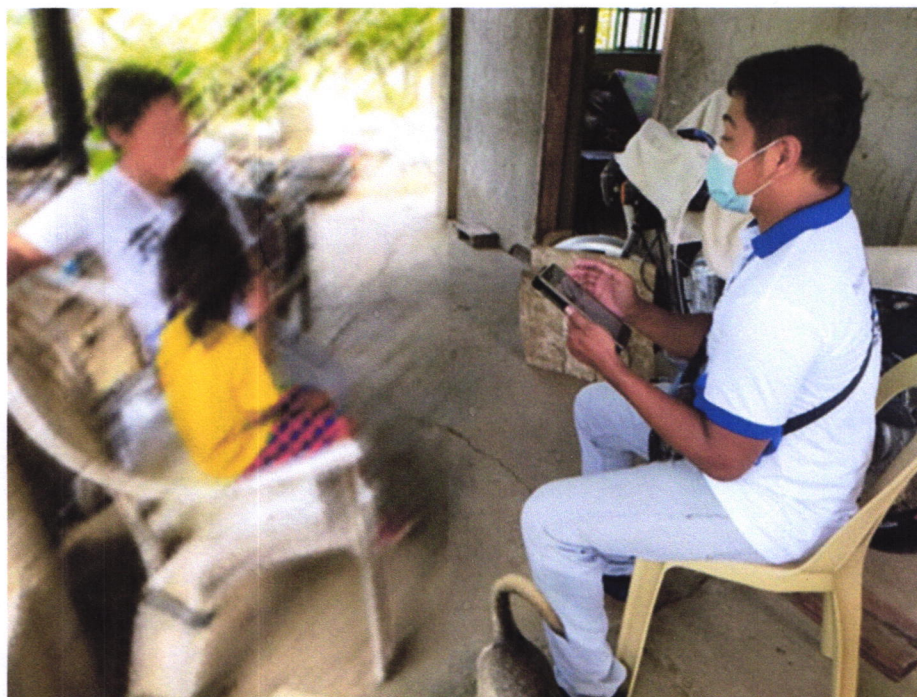
An enumerator interviews the respondent of a sample household in the City of Batac, Ilocos Norte.

The Philippine Statistics Authority (PSA), in collaboration with the Bangko Sentral ng Pilipinas (BSP), conducts the October 2020 Consumer Expectations Survey (CES) enumeration on 1 to 13 October 2020.