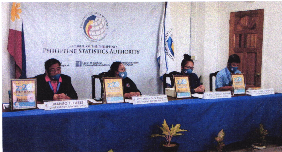
Key officials from PSA – RSSO I answer queries about the 2020 Census of Population and Housing during the virtual press conference.

The Philippine Statistics Authority - Regional Statistical Services Office I (PSA – RSSO I) kicks off the enumeration period of the 2020 Census of Population and Housing (2020 CPH) by conducting a virtual press conference with its media partners. The said activity is also available for viewing on the official Facebook account of the PSA - RSSO I.