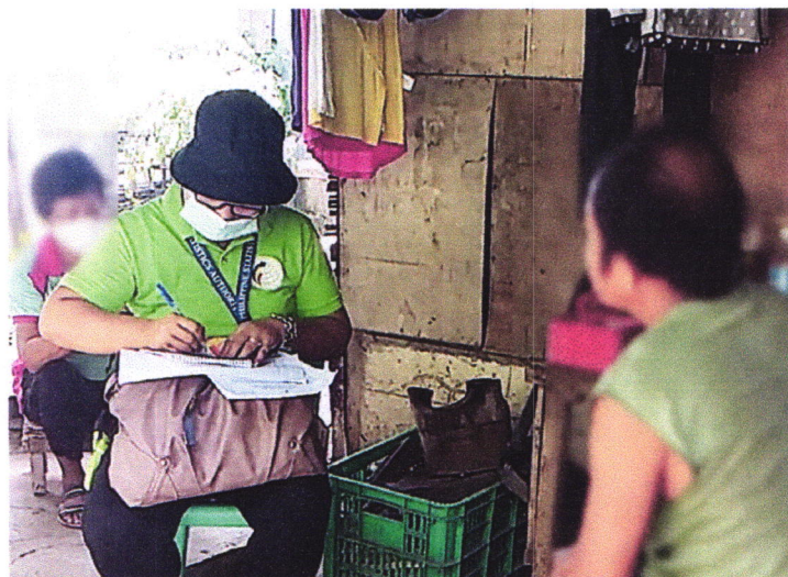
PSA – La Union's Statistical Researcher is conducting an interview for the July 2020 Labor Force Survey and 2020 Annual Poverty Indicators Survey in Bauang, La Union.

The Philippine Statistics Authority Regional Statistical Services Office I (PSA-RSSO I) will conduct the July 2020 Labor Force Survey (LFS) together with the 2020 Annual Poverty Indicators Survey (APIS) which will commence on 08 July 2020 and will end on 31 July 2020.