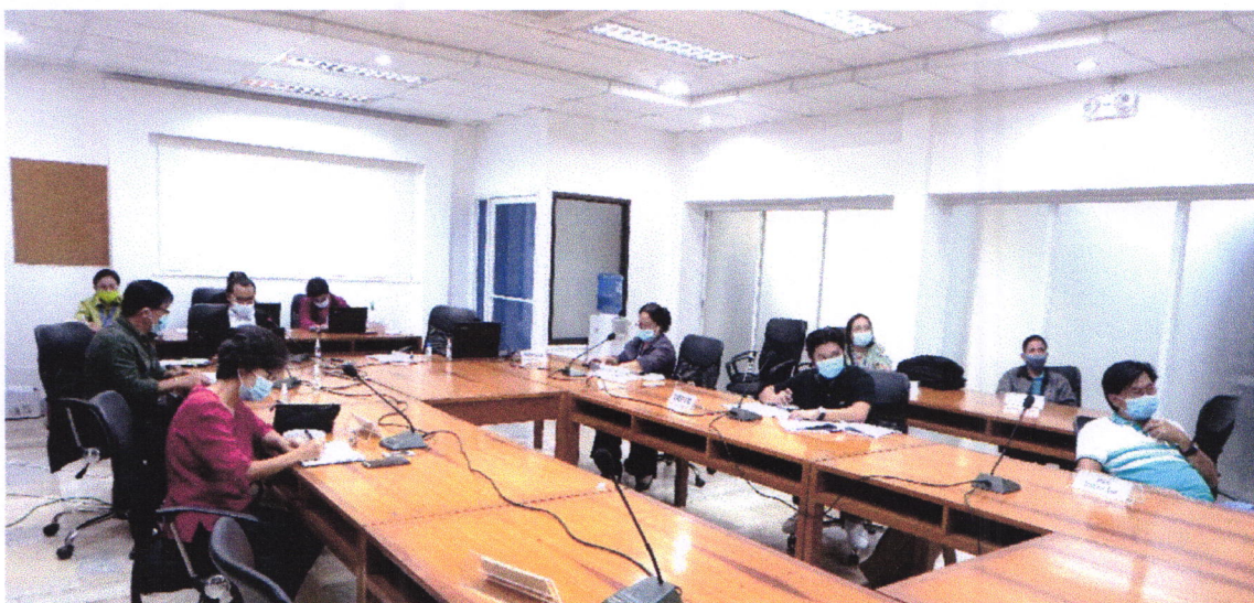
PSA – RSSO I and other member agencies attend onsite at the first RSC I virtual meeting. The members observe physical distancing and wearing of masks as part of RDC I protocols on virtual meetings.