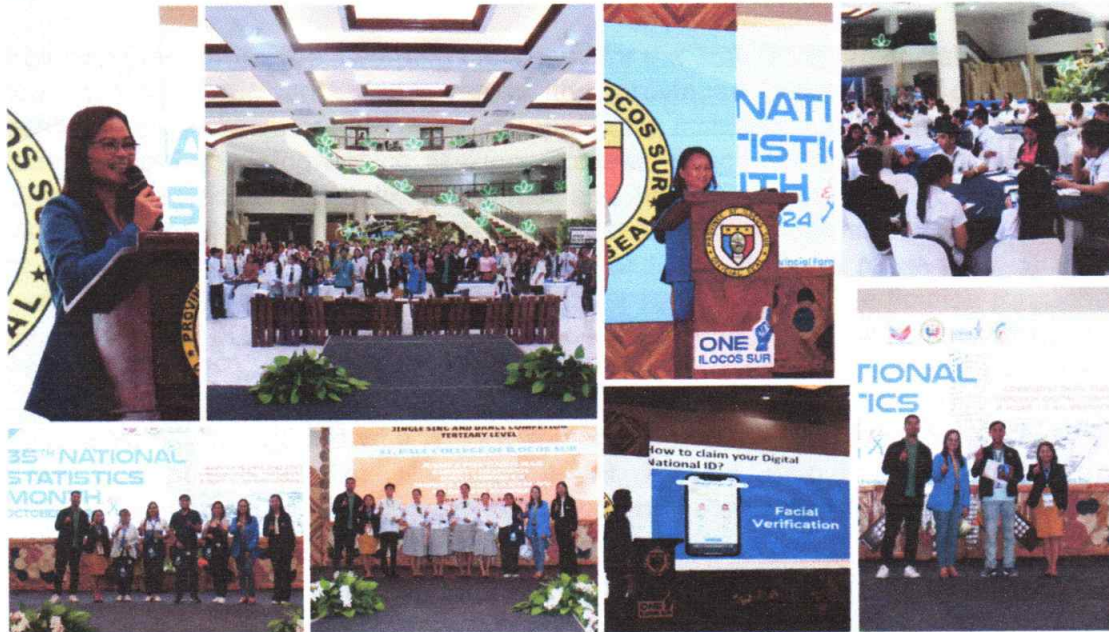
Snapshots during the 35 th NSM Closing Ceremony at the Provincial Farmers Livelihood Development Center, Vigan City, Ilocos Sur on 30 October 2024.

Date of Release: 12 November 2024 Reference No. 2024-073