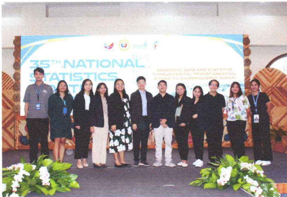
Representatives from the PSA Ilocos Sur with the trainers from PSRTI.

Date of Release: 21 October 2024 Reference No. 2024-070