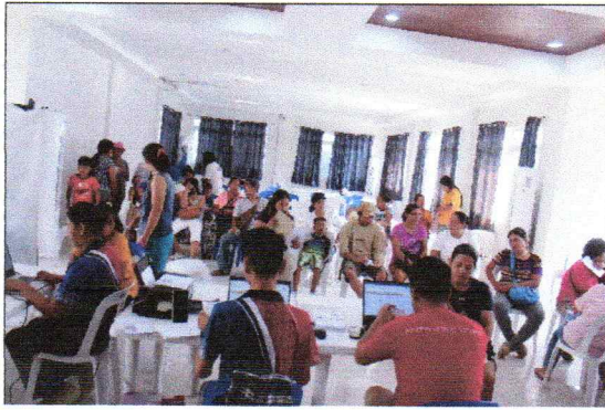
Beneficiaries queue for the authentication of PhilID during the FDS activity in Anaao, Alilem, Ilocos Sur.