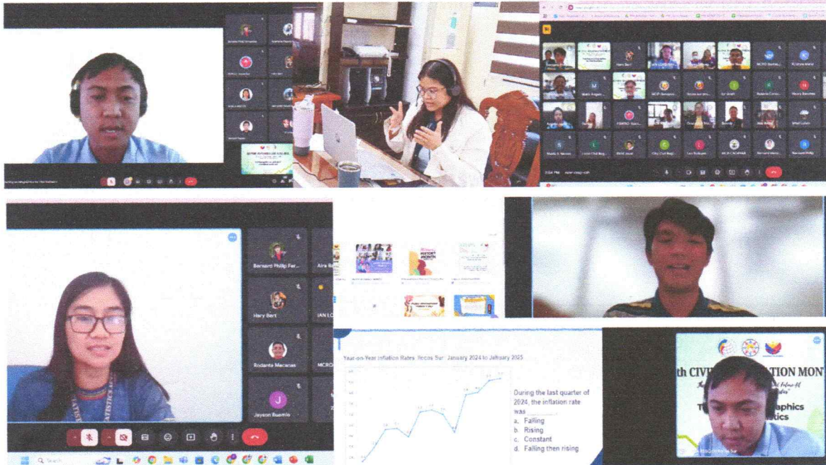
Photos taken during the training on Infographics for Vital Statistics.

Date of Release: 04 March 2025 Reference No. 2025 – 014