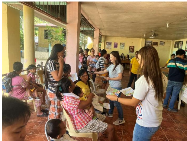
PhilSys RKO distributes PhilSys flyers to the registrants in Parasapas, Rosario, La Union.