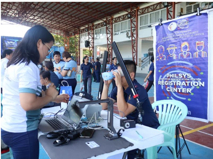
RKO Lacsa facilitates the National ID registration of a PNP personnel during PNP Family Day.