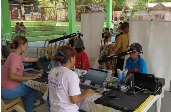
PhilSys La Union team covers unregistered residents of Brgy. Santa Monica, Bauang, La Union during mobile registration.