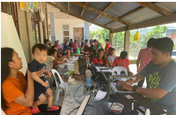
PhilSys La Union team during the registration and authentication of PhilID and ePhilID of 4Ps beneficiaries in Brgy. Maliclico, Sudipen, La Union.