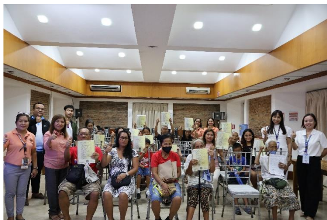
Recipients of BRAP pose for a group photo together with the officials and personnel from PSA-RSSO I, PSA-La Union, and LGU Bacnotan.