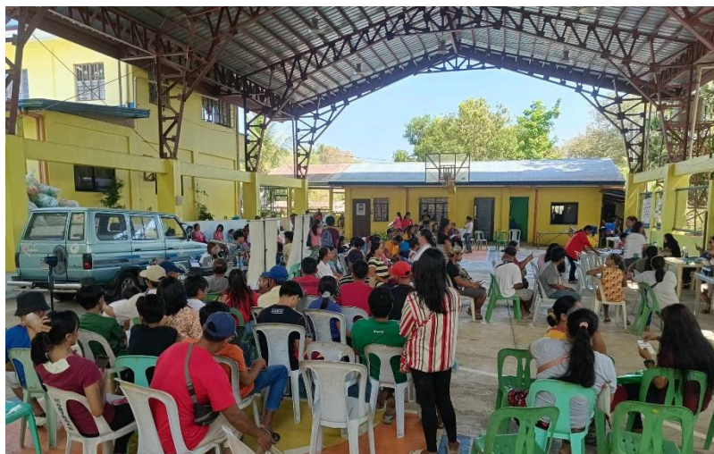
PSA-La Union PhilSys personnel conducts PhilSys registration and authentication of 4Ps beneficiaries in City of San Fernando, La Union