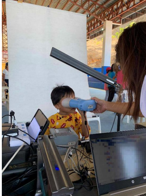
PSA-La Union, through its PhilSys team, facilitates the registration of unregistered children in Brgy. Pao, City of San Fernando, La Union.