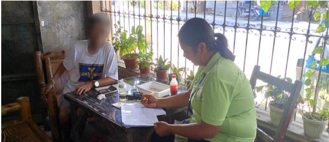
PSA-LA Union Statistical Researcher (SR) conducts CrPS household interview in San Julian Central, Agoo, La Union.