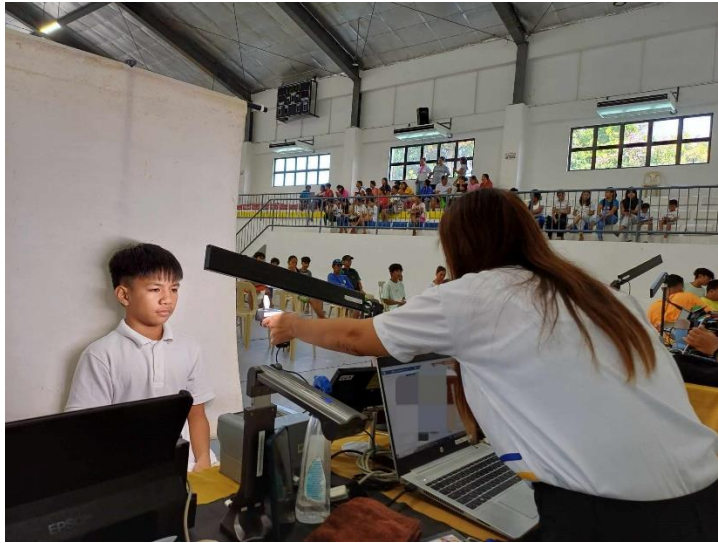
PSA - La Union and DSWD - LUFO facilitate the PhilSys authentication, ePhilID issuance, and TRN retrieval of 4Ps beneficiaries in Bauang, La Union.