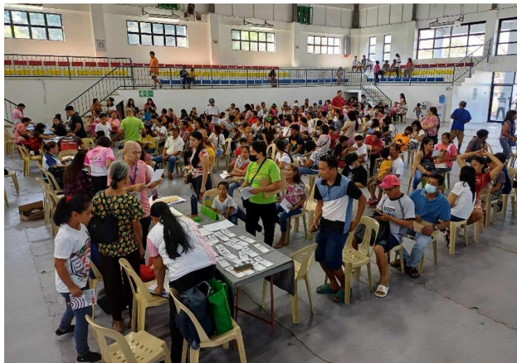
PhilSys registration personnel accommodate the unregistered 4Ps beneficiaries in Bauang, La Union.