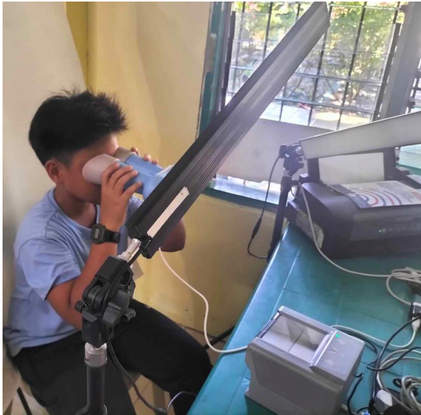
PSA-La Union, through its PhilSys team, facilitates the registration of the unregistered learners of Bigbiga Elementary School in Bauang, La Union.