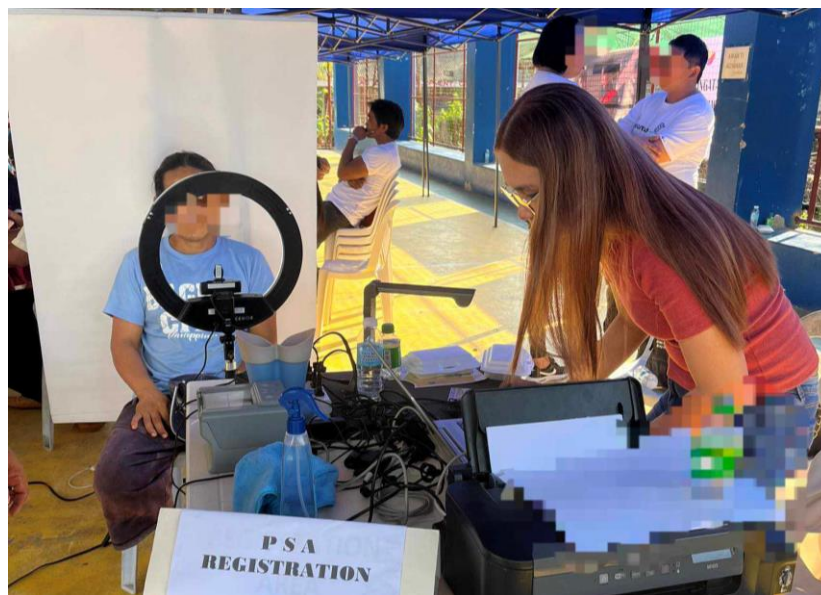
PSA-La Union PhilSys personnel conducts mobile registration in Brgy. Nagyubuyuban, San Juan, La Union to cover unregistered residents in the barangay.