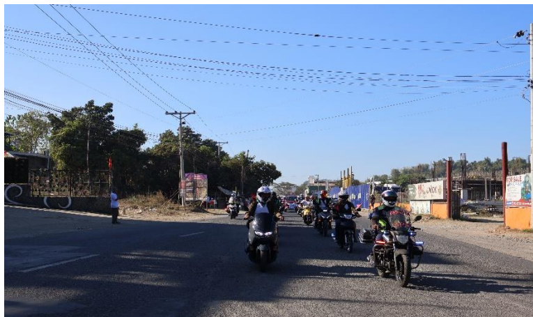
Police Officers escort the participants of the 34 th CRM motorcade.