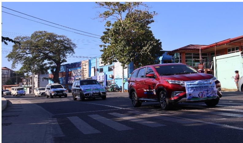
PSA vehicles together with the C/MCR vehicles participate the 34 th CRM motorcade around the City of San Fernando, La Union.