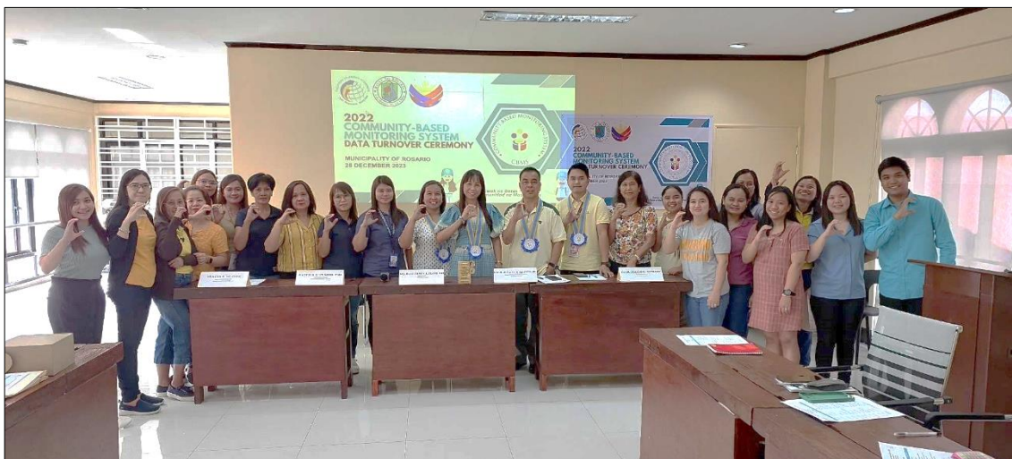
PSA and LGU officials and personnel pose with the CBMS hand symbol during the 2022 CBMS DTC.