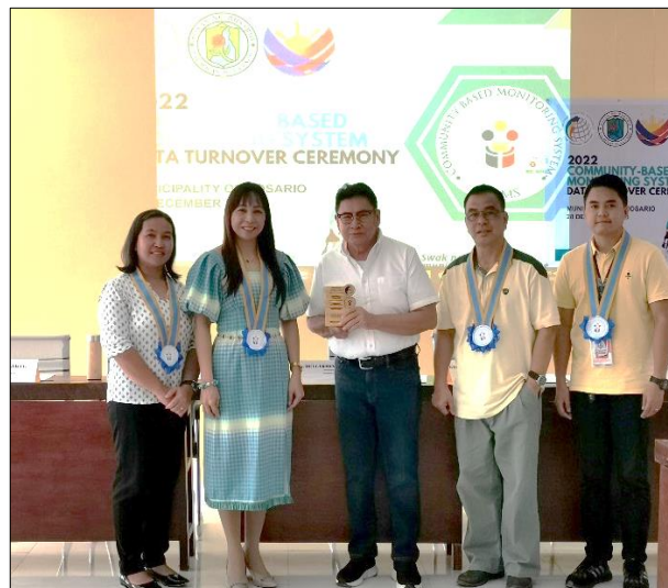
Mayor Atty. Bellarmin A. Flores II receives the symbolic data for the 2022 CBMS results for LGU Rosario, La Union.

Striving for continuous progress, the community development plans of LGU Rosario may now be enriched by employing data-driven local governance catering to the specific needs of its constituents.