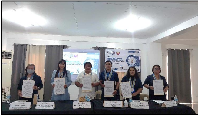
The PSA and LGU Bagulin officials and staff present the 2022 CBMS Data Turnover Agreement (DTA) after the ceremonial signing.