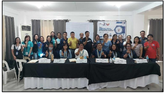
PSA and LGU-Bagulin officials and staff strike a pose after the 2022 CBMS DTC.