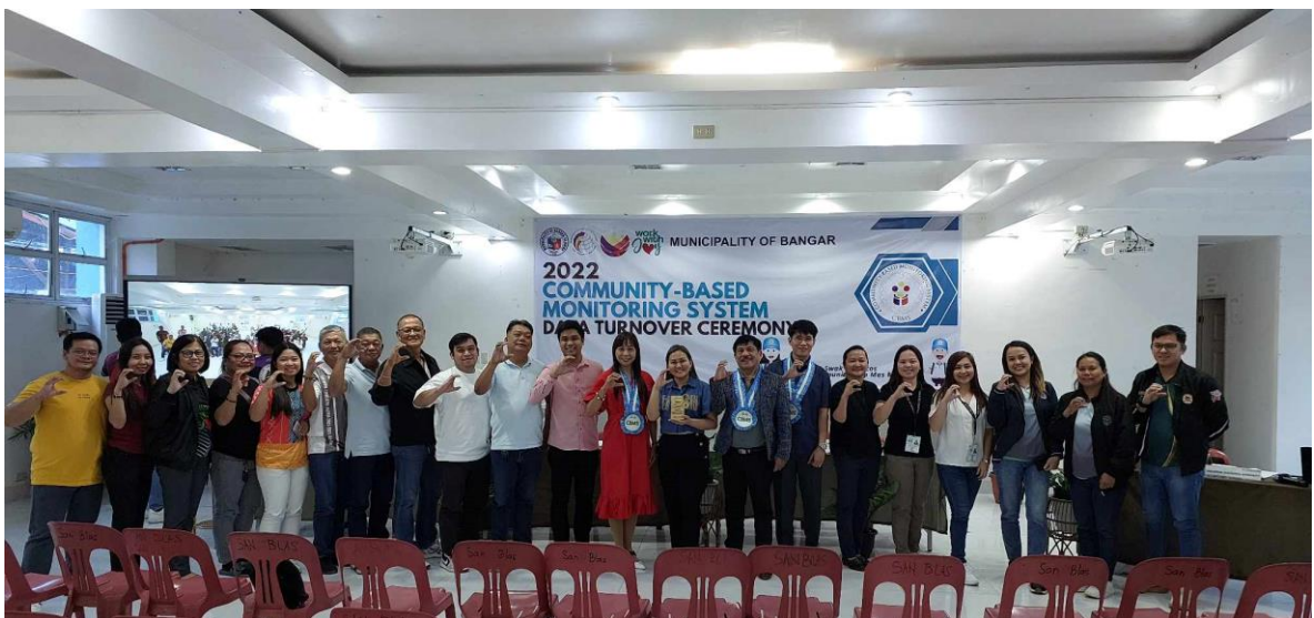
PSA officials and staff together with the LGU Banglar officials and department heads pose with the CBMS hand symbol after the turnover of 2022 CBMS.