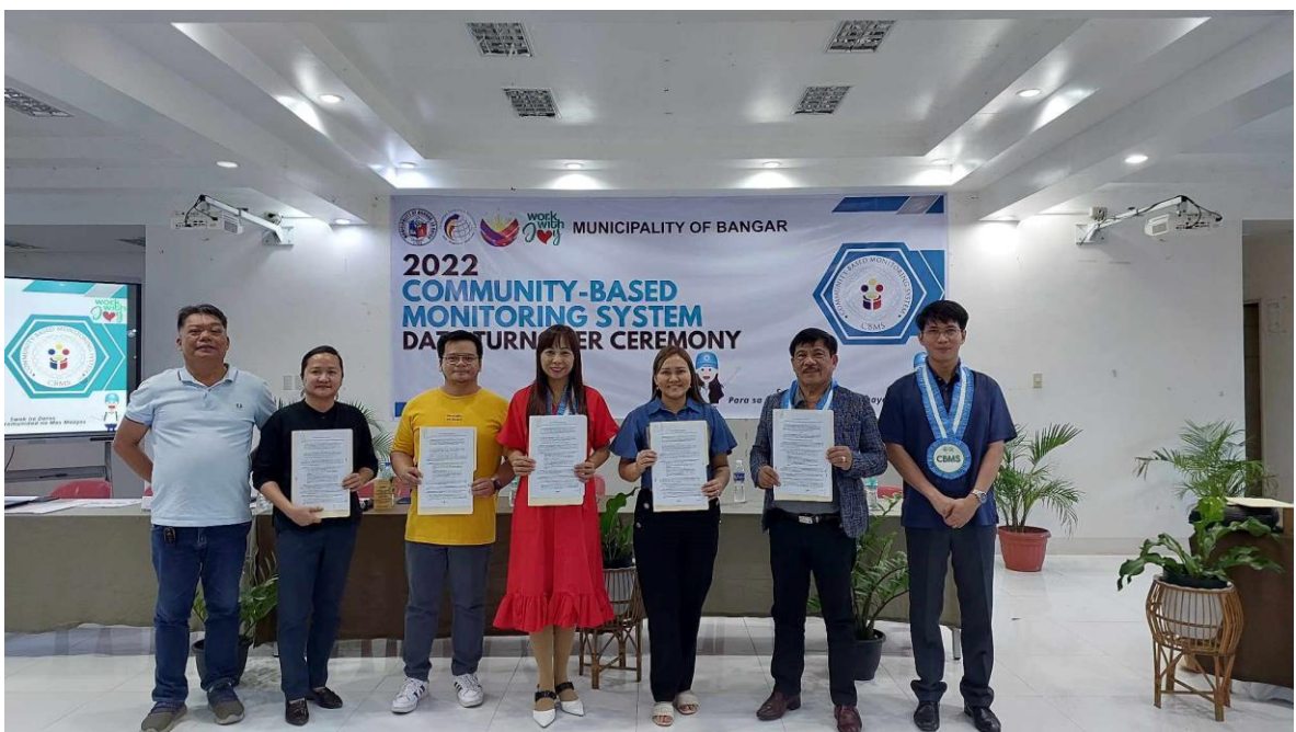
The PSA and LGU Banglar officials and staff present the 2022 CBMS Data Turnover Agreement (DTA) after the ceremonial signing.