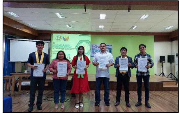
The PSA and LGU Pugo officials present the 2022 CBMS Data Turnover Agreement (DTA) after the ceremonial signing.