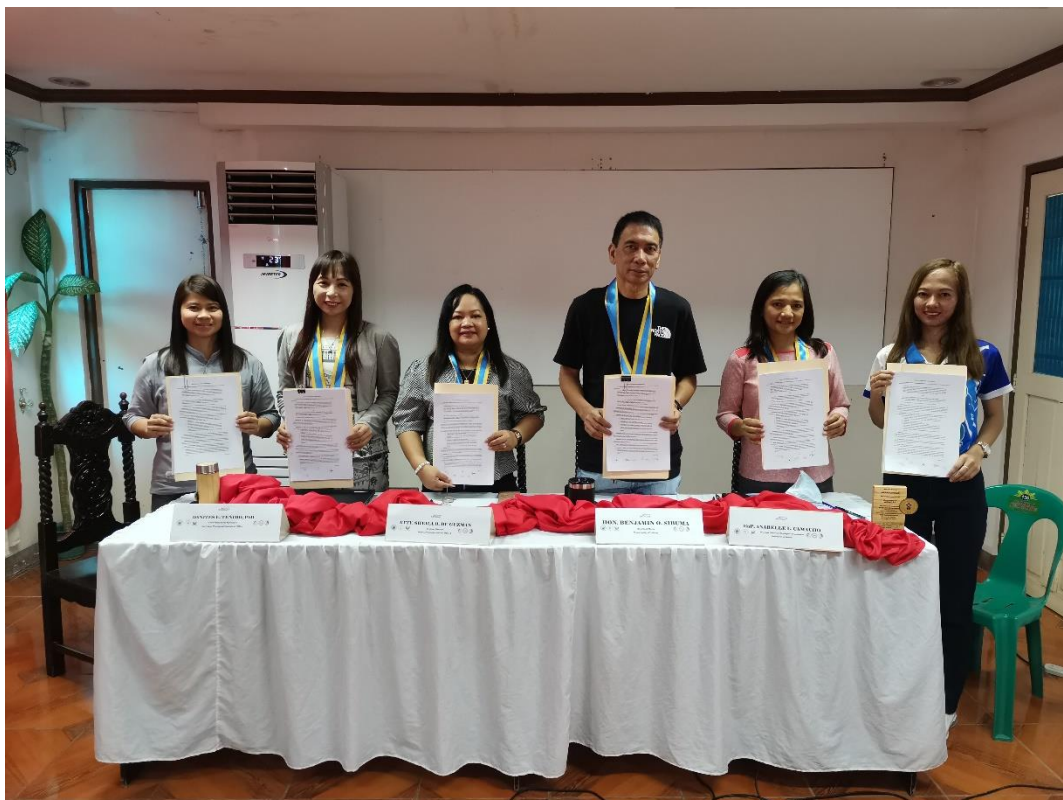
The PSA and LGU Aringay officials and staff present the 2022 CBMS Data Turnover Agreement (DTA) after the ceremonial signing.