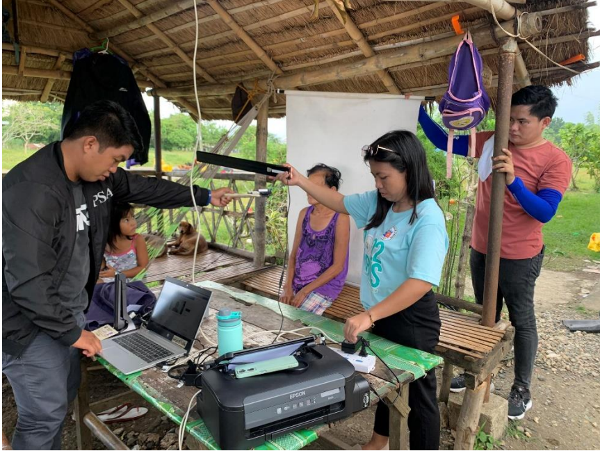
PhilSys Registration personnel registers a senior citizen during the conduct of “ PhilSys on Wheels. ”