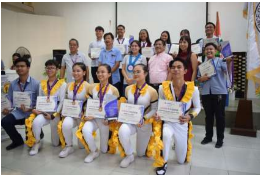
La Union National High School, provincial champion of the Jingle Sing and Dance contest, receive their award during the 34 th NSM Closing Ceremony.