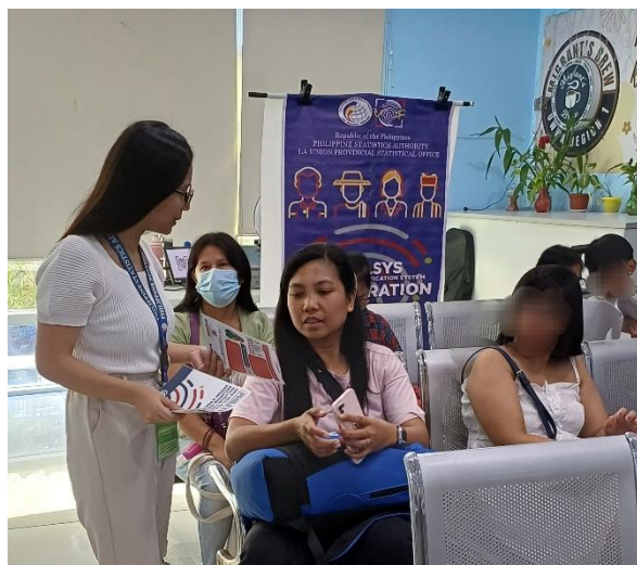
PhilSys La Union personnel distributes PhilSys advocacy materials to clients transacting at the OWWA Regional Welfare Office 1.