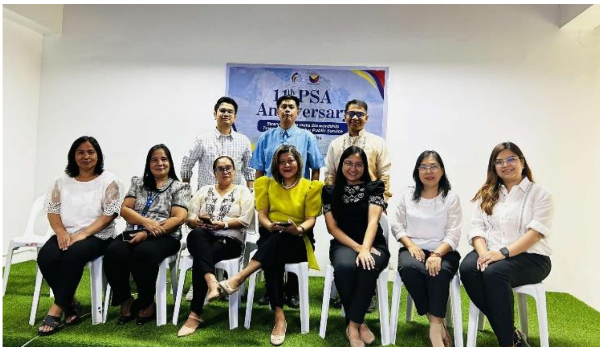
Personnel of PSO Ilocos Norte in their modern Filipiniana attire during the Online Recognition Ceremony via Zoom hosted by RSSO I.

Following the Thanksgiving Mass, PSA Ilocos Norte staff gathered to participate in an Online Recognition Ceremony via Zoom hosted by RSSO I. This virtual event allowed employees to gather and celebrate the milestones of long-serving colleagues while fostering a sense of unity and pride within the PSA family.