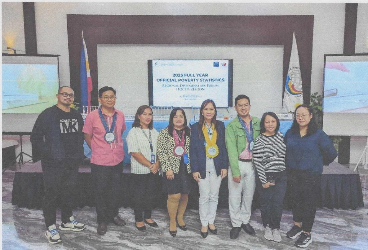
Officials and staff of PSA-RSSO I, PSA Central Office and NEDA – RO1 pose for the Regional Dissemination Forum of Ilocos Region’s 2023 Full Year Official Poverty Statistics.

Date of Release: 19 November 2024 Reference No. 2024-066