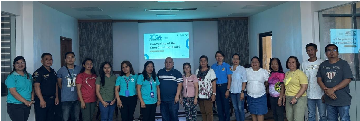
Representatives from the Municipal CBMS Coordinating Board together with representatives from the Ilocos Norte Provincial Statistics Office during the 2 nd Convening in the Municipality of Pinili

Date of Release: 15 May 2024 Reference No. 2024-06