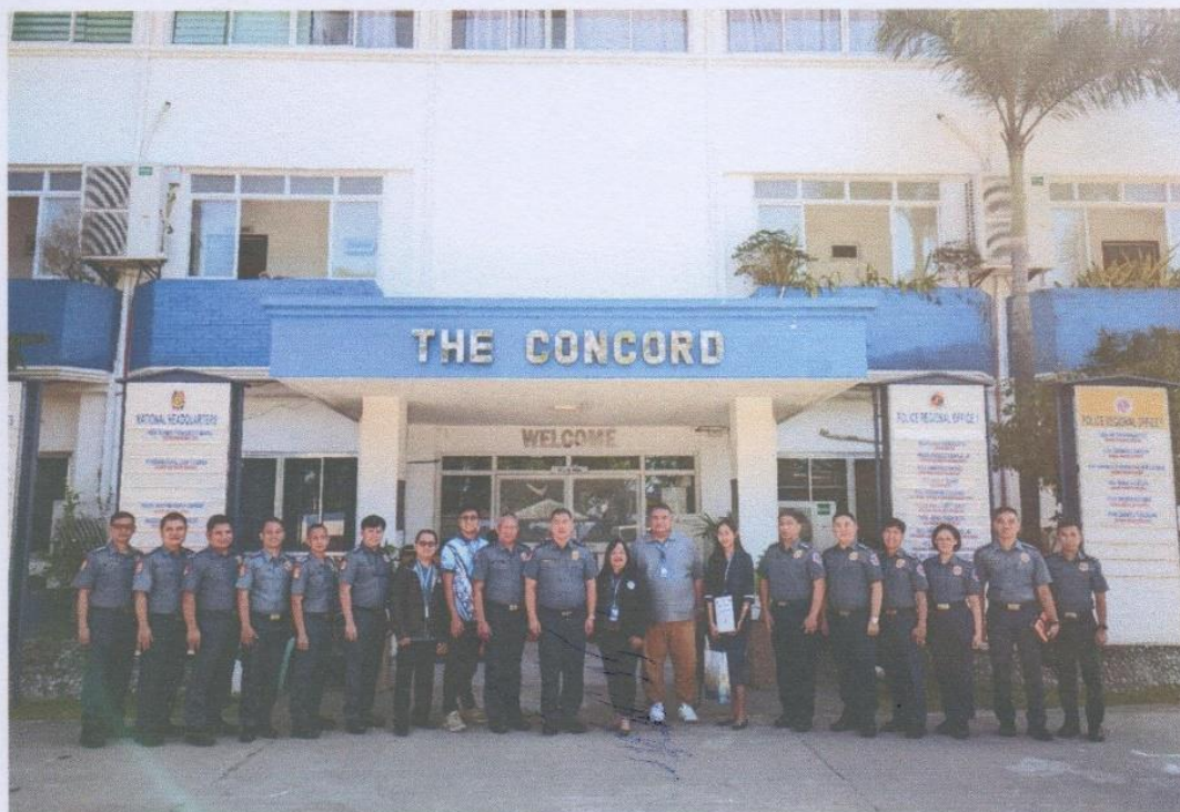
Officials and staff of PSA-RSSO I and the Philippine National Police – Police Regional Office I.

The Philippine Statistics Authority - Regional Statistical Services Office I (PSA-RSSO I) conducted the National ID Authentication Services Seminar and Information Dissemination on Civil Registration at the Philippine National Police – Police Regional Office I (PNP - PRO 1), City of San Fernando, La Union, on 21 January 2025.