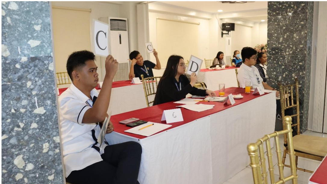
In photo: 28 th Philippine Statistics Quiz Provincial Elimination contestants vying for the title as Provincial Champion of Pangasinan