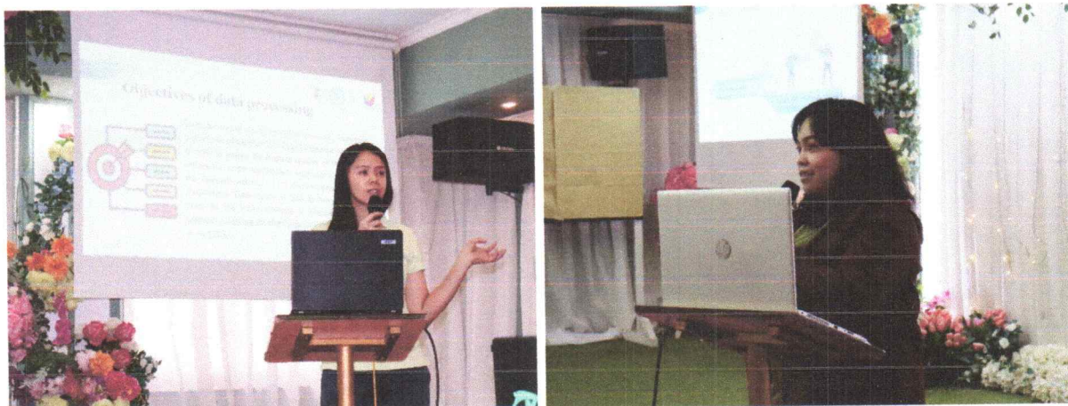
Resource persons from CTCO-NCS showing their prowess in presenting their topics to the participants