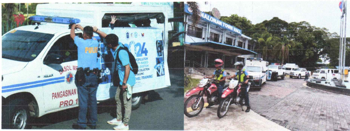
In photos: Conduct of 2024 POPCEN-CBMS Bandilyo Roadshow/Motorcade in LGU Dasol (Left) and LGU Binalonan (Right) (Photo courtesy: LGU Dasol and LGU Binalonan).

Seven (7) LGUs namely: City of Alaminos, Bautista, Binalonan, Burgos, Dasol, Infanta, and Mangatarem conducted the 2024 POPCEN-CBMS Bandilyo. The 2024 POPCEN-CBMS Bandilyo is a dedicated initiative for the promotion of the census undertaking through a form of roadshow or motorcade. During the activity, the official 2024 POPCEN-CBMS recorded audio public announcements were played during the roadshow. Information and education campaign materials such as primers and brochures were also distributed to the locals as part of the information campaign. Through the conduct of Bandilyo, residents were well-informed on the ongoing data collection, thus ensuring a well-participated 2024 POPCEN-CBMS.