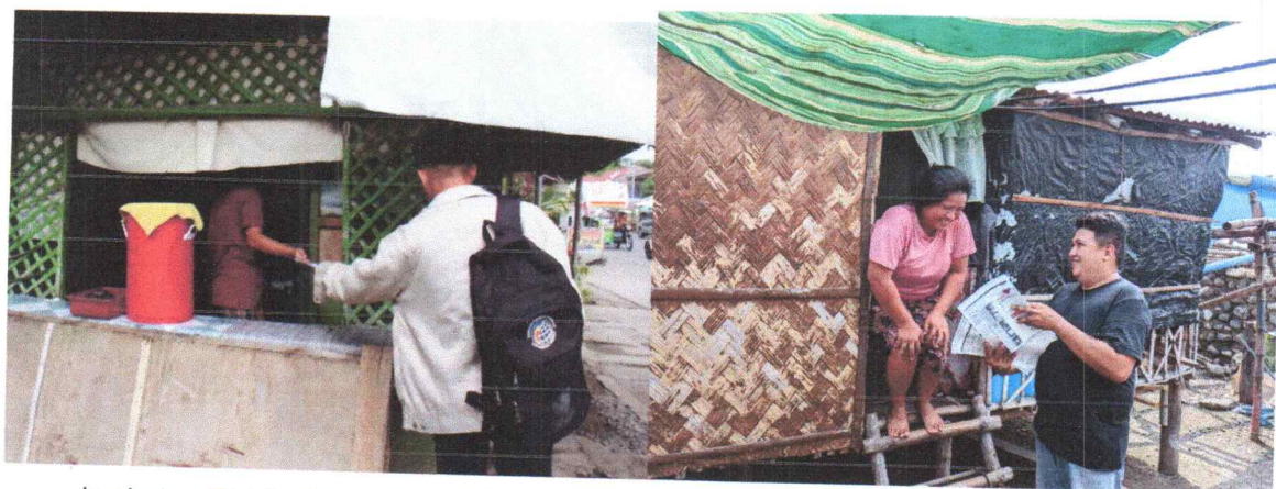
In photos: Distribution of 2024 POPCEN-CBMS IEC materials during the conduct of Bandilyo in LGU Bautista (Left) and LGU Infanta (Right) (Photo courtesy: LGU Bautista and LGU Infanta).