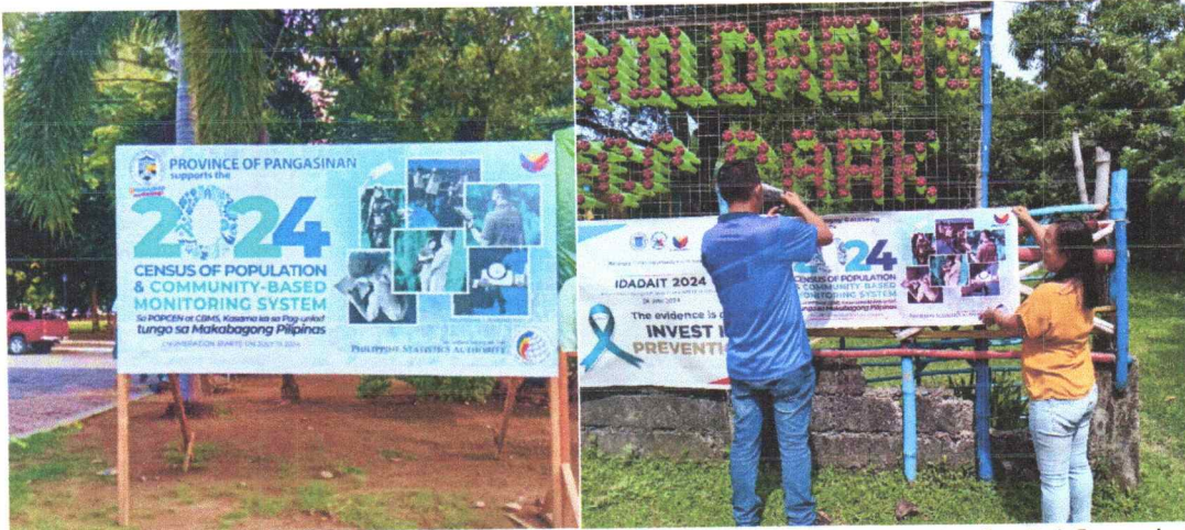
In photos: (Left) Official Streamer of 2024 POPCEN-CBMS displayed at the Capitol Grounds in Lingayen, Pangasinan; (Right) Actual hanging of the streamer by Barangay Official and Staff at Brgy. Calabeng, Bani, Pangasinan.

is to promote people's awareness and to ensure a very high participation rate that will lead to the success of these two integrated major activities.