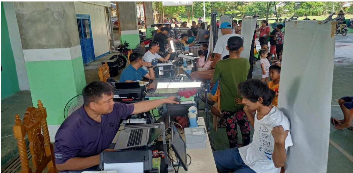
Mabini, Pangasinan - Registration Kit Operators and registrants during the registration of 4Ps beneficiaries.

The final wave of the co-location activity happened in Mabini, Bolinao, Anda, Burgos, Agno, Pozorrubio, San Nicolas, Natividad, Sta. Maria, Sison, Balungao, Sto. Tomas, Infanta and Dasol on June 2024.