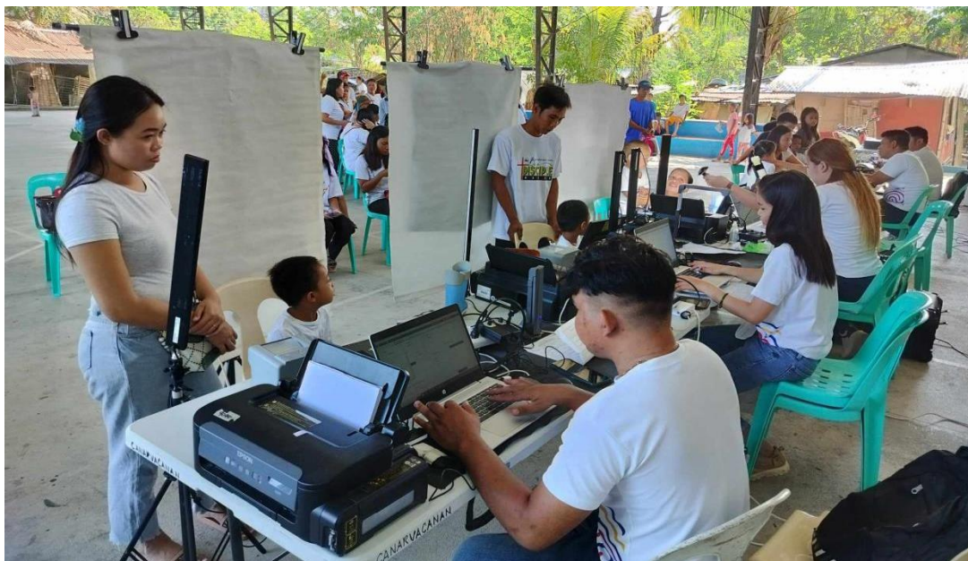
PHOTO: Registration Kit Operators accommodate children 1-4 years of age during the co-location activity in Binalonan, Pangasinan .

The Philippine Statistics Authority (PSA) has collaborated with the Department of Social Welfare and Development (DSWD) to cater National ID registration and provide authentication services to beneficiaries of the Pantawid Pamilyang Pilipino Program (4Ps) through the Philippine Identification System (PhilSys).