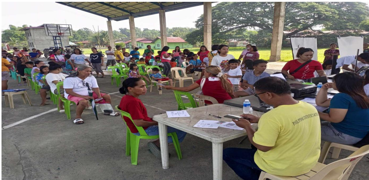
Natividad, Pangasinan - Registration Assistants verifying the National IDs of 4Ps beneficiaries using PhilSys Check.