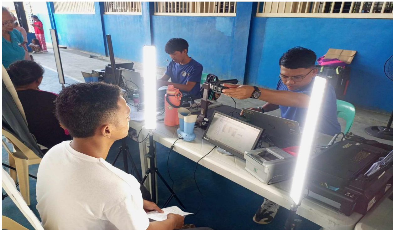
Urdaneta City, Pangasinan - Registration Kit Operators assisted DSWD beneficiaries as they register to the National ID.

The province-wide undertaking was initiated by the DSWD, as part of its commitment to register members and their dependent children to PhilSys. The collaborative project solidifies a comprehensive coverage of 4Ps beneficiaries across Pangasinan. With the support from the Local Government Units (LGUs) and the barangays, PhilSys was able to extend registration and authentication services closer to the beneficiaries during the DSWD Family Development Sessions.