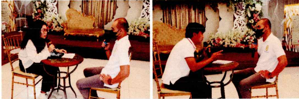
Hired Census-CBMS Area Supervisors during the conduct of Mock Interview using CAPI

Participants were also given a chance to apply their learnings through a mock interview on the last day of the training on which discussions on observations, comments, and suggestions were done afterwards.