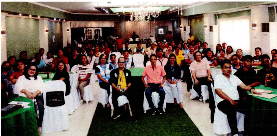
Photo Opportunity of Trainers, Guests, Head Census-CBMS Area Supervisors (HCAS), and Hired Census-CBMS Area Supervisors (CAS) during the 1 st day of 2024 POPCEN-CBMS Household Data Collection and Geotagging Provincial Level Training last 17 June 2024 at Pangasinan Regency Hotel, Calasiao, Pangasinan

In preparation for the upcoming rollout of the 2024 Census of Population and Community-Based Monitoring System (POPCEN-CBMS) on the 15 th of July this year, the Provincial Statistical Office of Pangasinan spearheaded the Household Data Collection and Geotagging Provincial Level Training on 17-22 June 2024 at Pangasinan Regency Hotel, Calasiao Pangasinan.