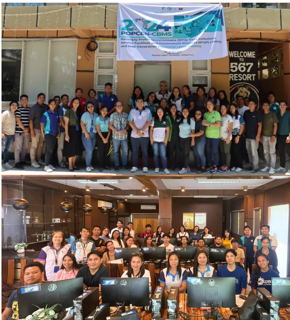
Photo opportunity of the participants and PSO and CO trainers during the Barangay Profile Questionnaire Data Collection, Service Facilities and Government Projects Listing (Upper Photo), and Map Generation (Lower Photo) Provincial Level Training