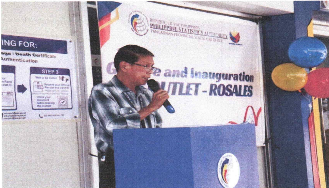
PHOTO: CSS Edgar M. Norberte warmly acknowledged the honorable guests and welcomed the public to the new CRS outlet in Rosales.