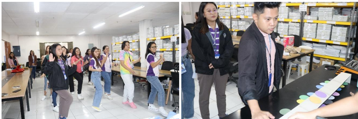
PHOTO: Fun and games were seen during the Fitness Friday as part of the 2024 National Women's Month Celebration on 22 March 2024.

The day was also devoted for a Fitness Friday in support of Health and Wellness activities of the agency. The activity promotes well-being and raise awareness on the importance of nutrition, physical activity, and commitment to a healthier and happier PSA.