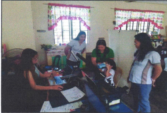
PhilID Registration of a grade school student from Hermoza Elementary School in Bayambang, Pangasinan; assisted by PhilSys personnel, in support of her teachers.