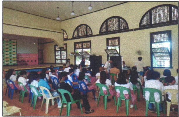
Students from Pangasinan National High School in Lingayen, Pangasinan undertake registration for their PhilID.

In regard to this growing achievement, Pangasinan Statistical Office is actively participating in various junctures across the province to disseminate information and exposure that will provide the public with familiarity and acceptance of the PhilID. PSA Pangasinan conducted several symposia on PhilSys institutional registration during the Civil Registration Month last February 2023, in which DepED Pangasinan School Divisions participated; government agencies and private sectors in the province joined the PhilSys Regional Roadshow last March 2023; and Step 2 Registrations were provided on "Community-Based Konsulta Plus" Program of the Pangasinan Hospital System, held at various barangays in the province. Among these activities, PSA Pangasinan continues to accommodate participation in activities such as job fairs and barangay assembly, to reach more people into registering for the PhilID.