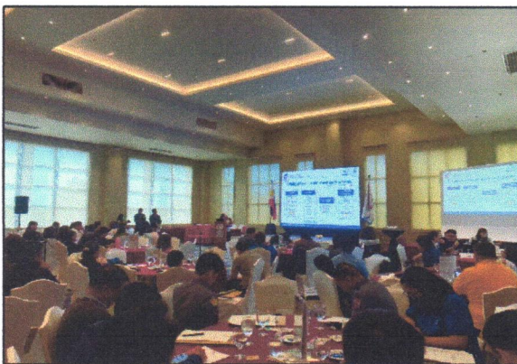
27 March 2023 – Government agencies and private sectors partook the PhilSys Information, Education, and Communication Campaign: Regional Roadshow in Calasiao, Pangasinan.