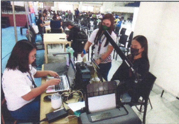
18 February 2023 – PhilSys Personnel registered an applicant during the Job Fair Caravan in Binalonan, Pangasinan.