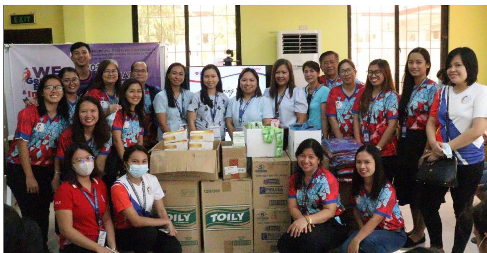
PSA Pangasinan Personnel with DSWD HFW Staff