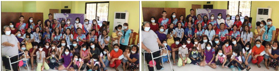
PSA Pangasinan Personnel with DSWD HFW Staff and center beneficiaries

In addition, a Social Responsibility Activity was undertaken to offer assistance for the beneficiaries of the said center. Haven for Women is a residential care facility catering to women survivors of abuse along with their dependents, eighteen (18) to fifty-nine (59) years old, who need temporary protective custody and other services that will promote healing and recovery. Assorted supplies were donated to the center, which include children's clothings, bath soaps, face masks, alcohol, tissue rolls, microfiber cloths, cotton balls, etc.