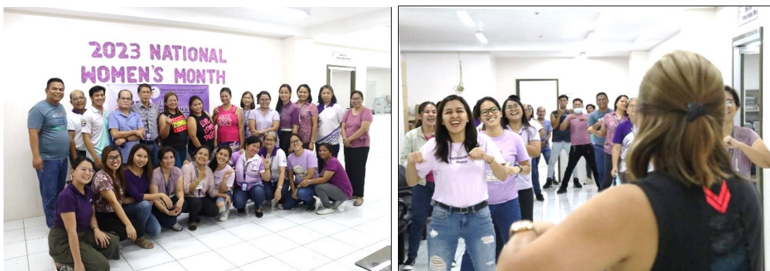
PSA Personnel together with the Zumba instructors during the dance session.

Physical health and wellness of all PSA Pangasinan personnel was also deemed important. Hence, the office initiated its Wellness Biyernes program conducted every last Friday of the month. This month, the Office conducted a Zumba dance session last March 31, 2023, to promote overall wellness of everyone and as a culminating activity of the National Women's Month Celebration. Zumba instructors were invited to facilitate the session.