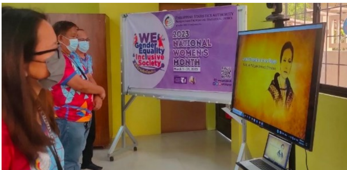
PHOTO: All-Women Cast Lupang Hinirang Video was highlighted during the program of National Women's Month Celebration.

All national and local government agencies, including PSA Pangasinan, highlighted the All-Women Cast Lupang Hinirang Video in all Flag-Raising Ceremonies in March 2023. Said AVP was also used during preliminaries in other events of PSA Pangasinan for the month.