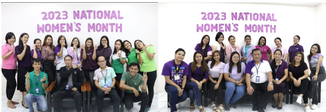
PHOTO: PSA Pangasinan personnel posed for photo wearing their purple-inspired attires for #PurpleWednesdays.

All personnel of PSA Pangasinan were encouraged to wear any attire with a shade of purple on all Wednesdays of March to signify support for 2023 National Women's Month Celebration.