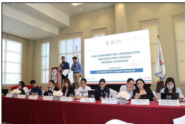
[27 March 2023] PSA Officials and their staff frontlines the 2023 PhilSys Information, Communication, and Education Campaign Regional Roadshow