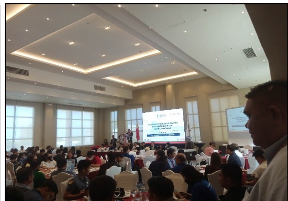
[27 March 2023] The regional roadshow was attended by government offices, the financial and private sectors in Pangasinan.